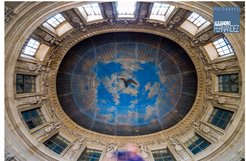
The current painting of the Grand Salon, representing an eagle in a cloud-studded sky, was created in the middle of the 19th century

350 years ago, the painter-decorator Charles Le Brun completed the design for an exceptionally large fresco on the cupola of the Grand Salon. The cupola stands 60 feet above the floor and totalizes a surface of 1,300 square feet, the largest in France at the time. Because of the arrest of Nicolas Fouquet in 1661, the painter could not even begin his work. Fortunately, a preparatory drawing still exists today at the Department of Graphic Arts of the Louvre Museum.