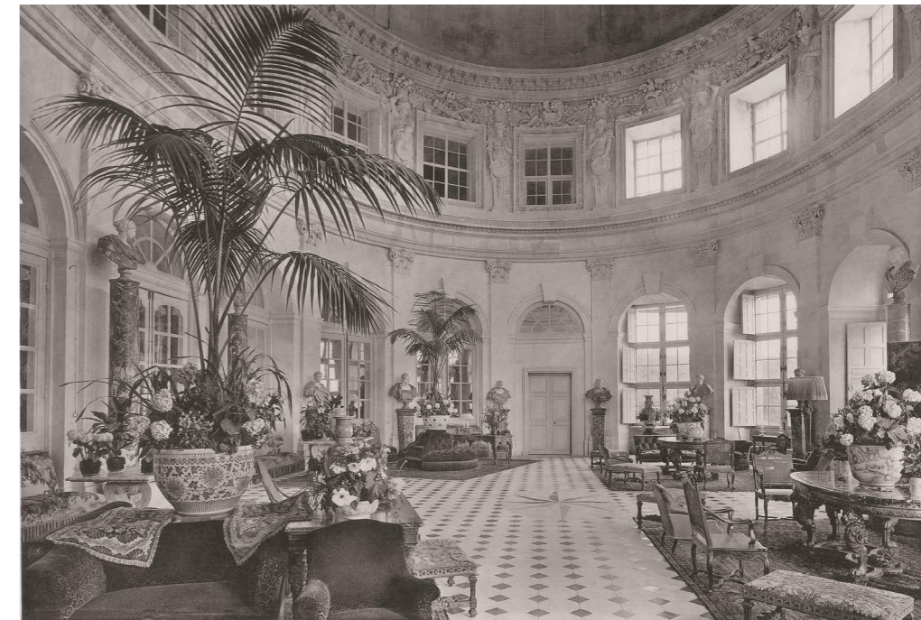
The Grand Salon in 1968