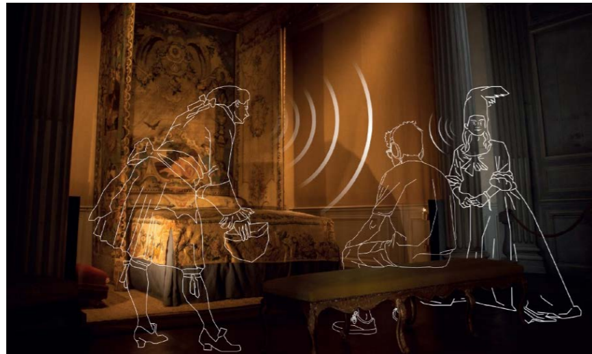
The 3-dimension sound will immerse the visitor in the 17th century history.

For this innovative project, 535 500 € needs to be collected during 2018.