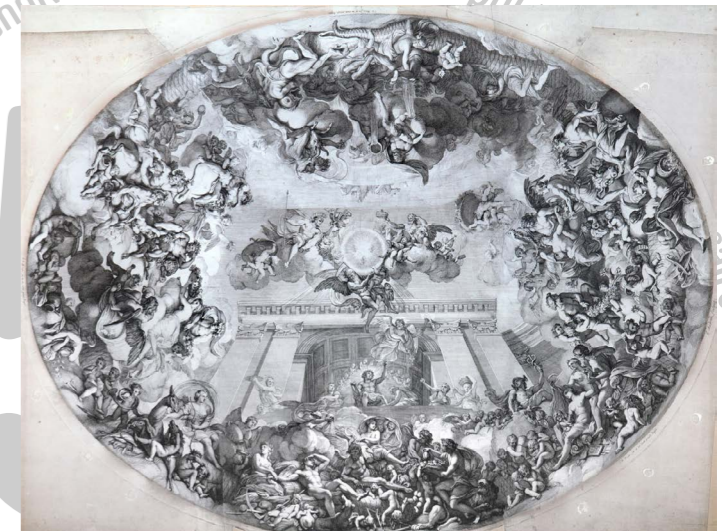
Preparatory sketch, by Charles le Brun, representing the Sun Palace

The challenge of such a projection is to offer visitors an enthralling three-dimensional spectacle using the whole of the architecture of the Grand Salon and its dome to project Le Brun's project in a didactic and immersive way via an innovative show mixing sound, light and video.